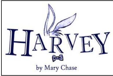
February Dinner Theatre February 10-12