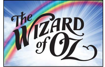
October Fall Musical October 26-28