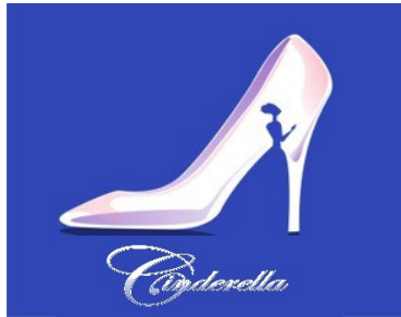
Fall Musical October 20-22