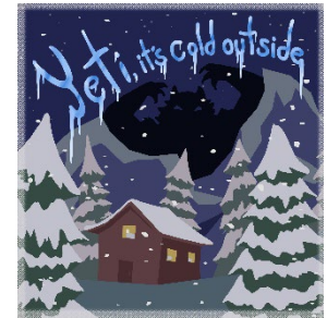
Christmas Showcase December 8-10