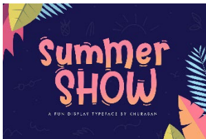
Summer Showcase – Kids July 28-30